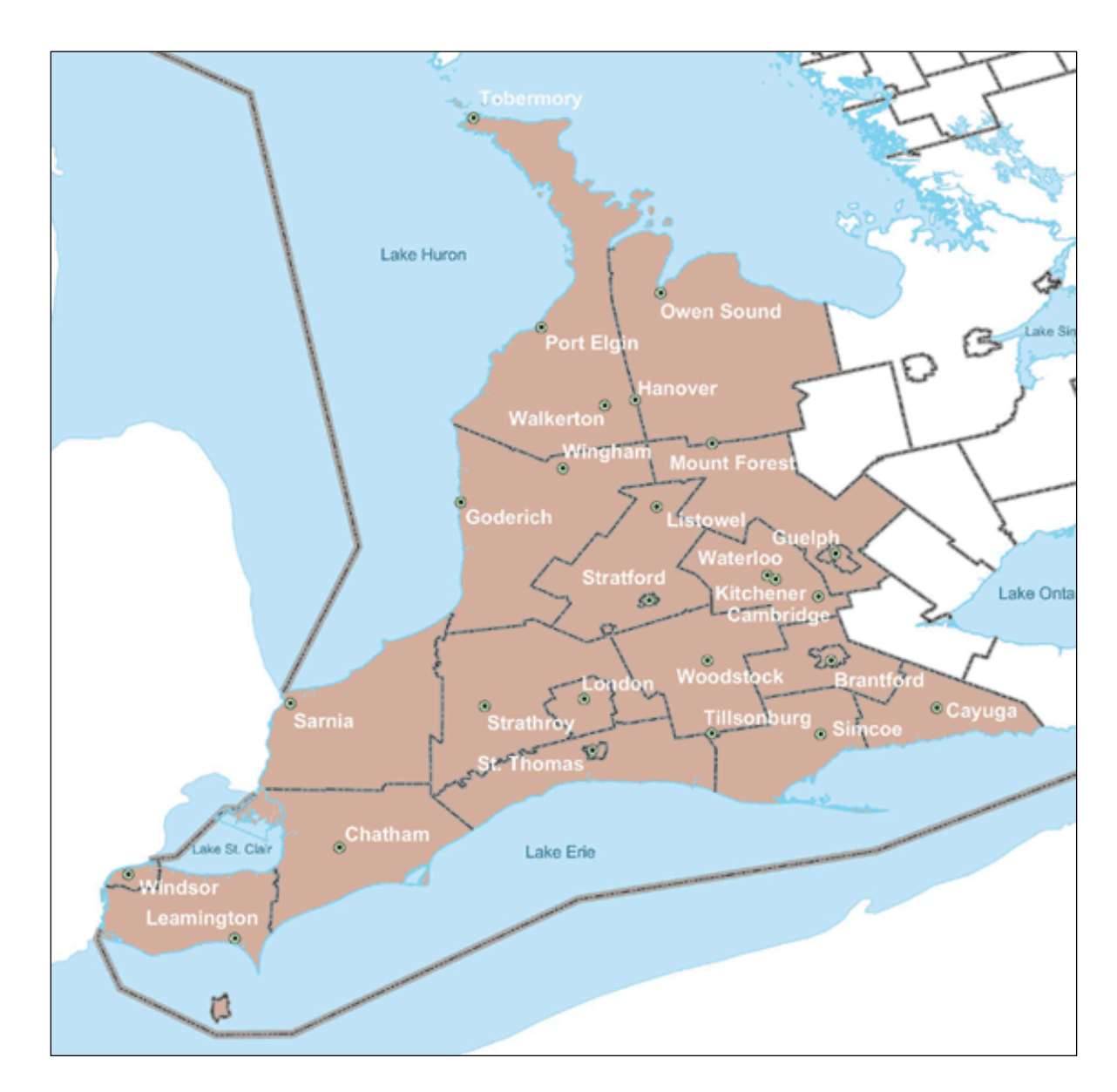
Appendix I: Map of Southwestern Ontario